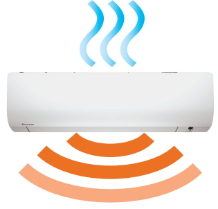
Cool Air Out