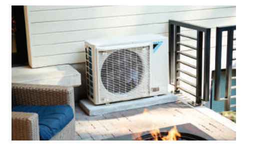
NEW DAIKIN FIT SIDE DISCHARGE SOLUTION