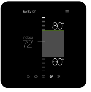
The away screen displays energy saving set-points. Energy saving can be invoked manually or automatically when the mobile app recognizes everyone is away.

The schedule screen displays upcoming set-point changes and scheduled times. It also offers access to edit mode, where you can adjust the schedule.