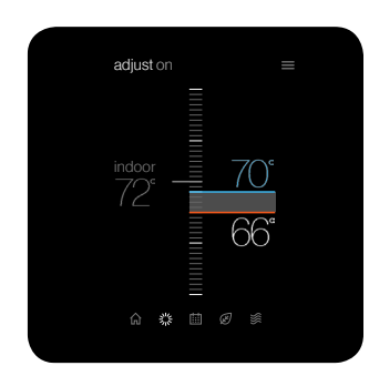
The adjust screen displays the current temperature on the left and set-points on the right. Change the set-points by dragging them or by turning the dial.