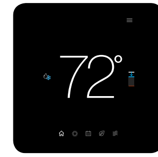
The home screen displays the current temperature, the current system mode, and icons leading to each of the top level screens.